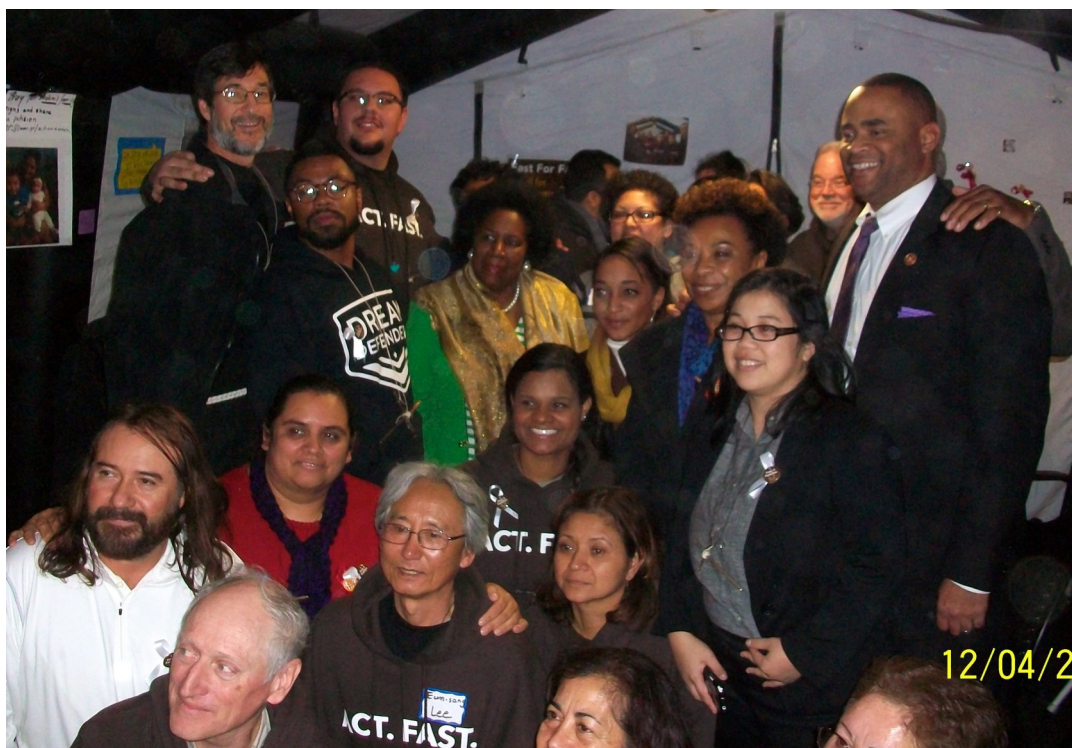
Members of the Congressional Black Caucus pose with fasters.